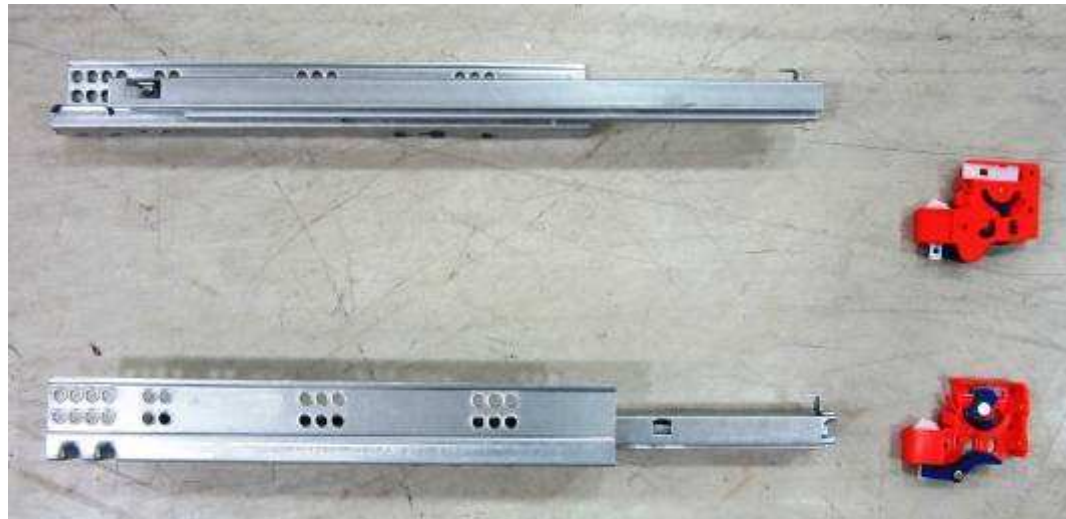
Pic. 3: Side view _ closed