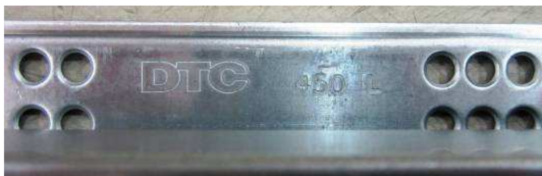
Pic. 4: Marking