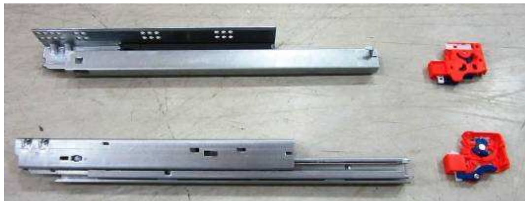
Pic. 1: Front view _ closed