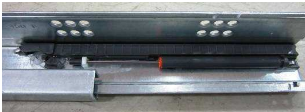
Pic. 5: Detail view of damper