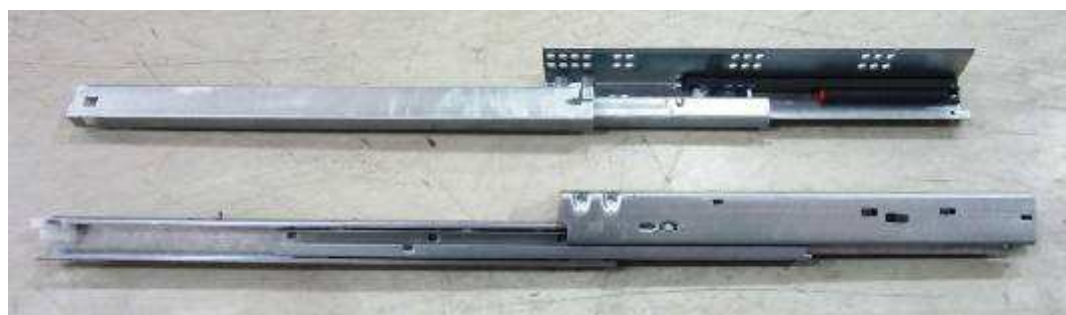
Pic. 2: Front view _ extended